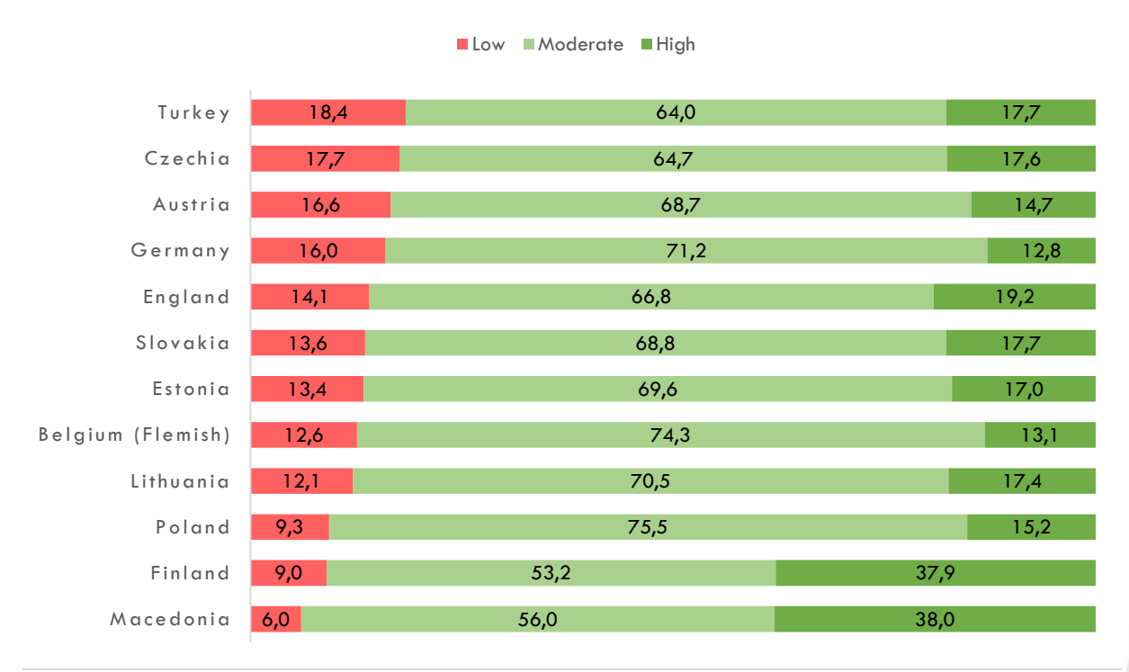
Figure 1: Comparative results on health literacy in European pupils (percentages, %)36-38